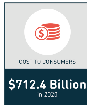
Aite Group. "U.S. Identity Theft: The Stark Reality." 2021.